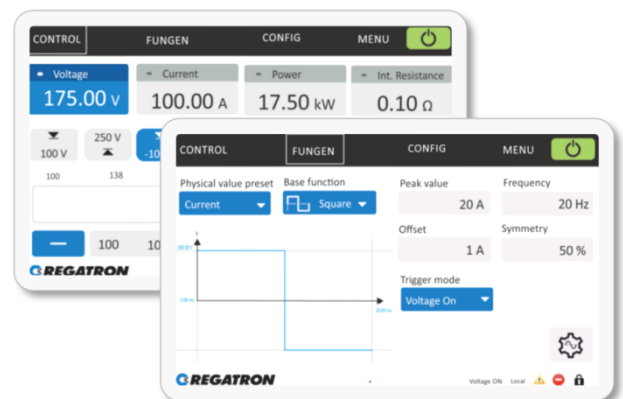
Figure 3: Intuitive control by HMI touch display. Everything you need at a glance.

With the remote control unit (RCU) it is possible to control the device or system from a distant location in the same manner as with the HMI.