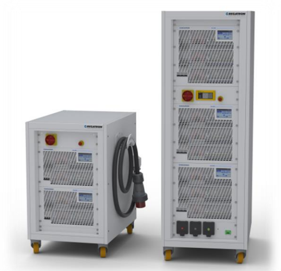
Figure 4: REGATRON's rack-integrated turn-key system solutions, e.g., 72 kW (left) and 162 kW (right) power levels. Various types of AC/DC connectors and cables allow for comfortable handling. Third-party product integration and numerous safety options are additional features.