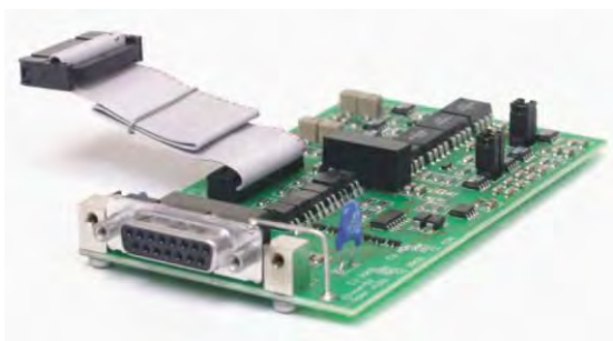
An ISO AMP CARD should be used in case of a non-floating programming source.