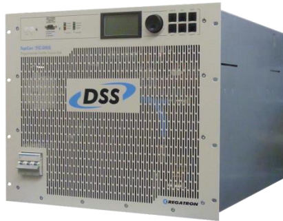
TopCon DSS Series with optional Human Machine Interface (HMI)