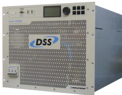
TopCon DSS Series with optional Human Machine Interface (HMI)